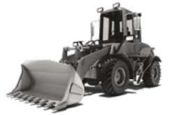
COMPACT WHEEL LOADERS