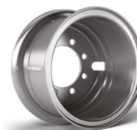
INDUSTRIAL MULTI-PIECE WHEEL