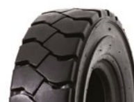
SOLIDEAL HAULER LT