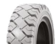
SOLIDEAL RES XTREME NM