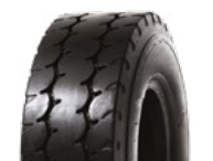
SOLIDEAL AIR 570