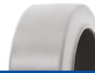
SOLIDEAL PON 555 NM