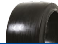
SOLIDEAL PON 555