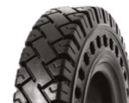
SOLIDEAL SOLIDAIR LT