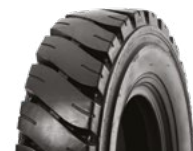
SOLIDEAL PORTMASTER HD