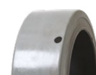
SOLIDEAL PON 775 NMAS