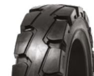
SOLIDEAL RES 330