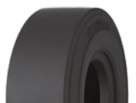
SOLIDEAL HAULER SM