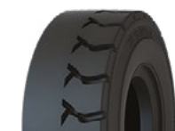
SOLIDEAL HAULER HA-TR