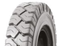
SOLIDEAL MAGNUM NM