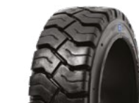
SOLIDEAL PON 550