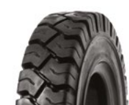
SOLIDEAL RES 550 MAGNUM SERIES