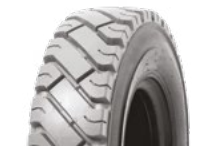
SOLIDEAL ED+ NM