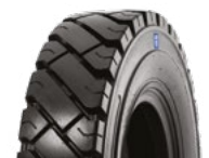
SOLIDEAL AIR 550