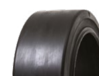
SOLIDEAL PON 775