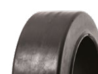
SOLIDEAL SM HL