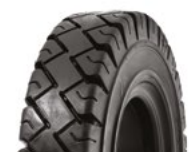
SOLIDEAL RES 660 XTREME SERIES